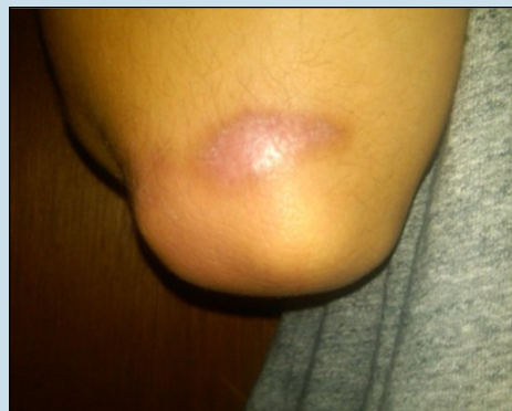
Elbow 12 Days After CellerateRX