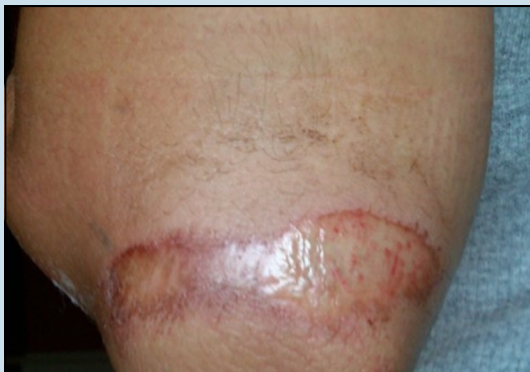
Elbow Before CellerateRX