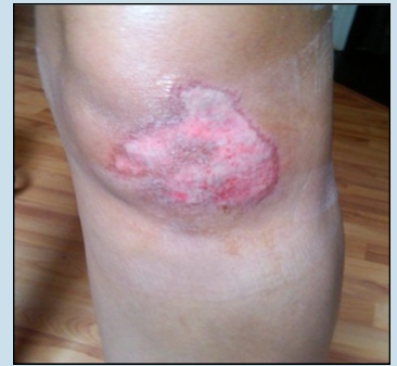
July 6th - Knee 2 days after accident - before use