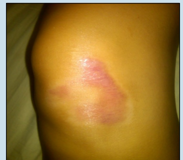
July 18th - Knee after 12 days of CellerateRX® use